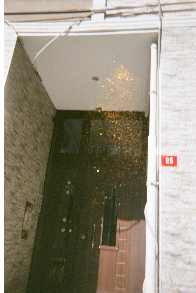
Dennissa Young Special Places: Istanbul 2 Performance documentation