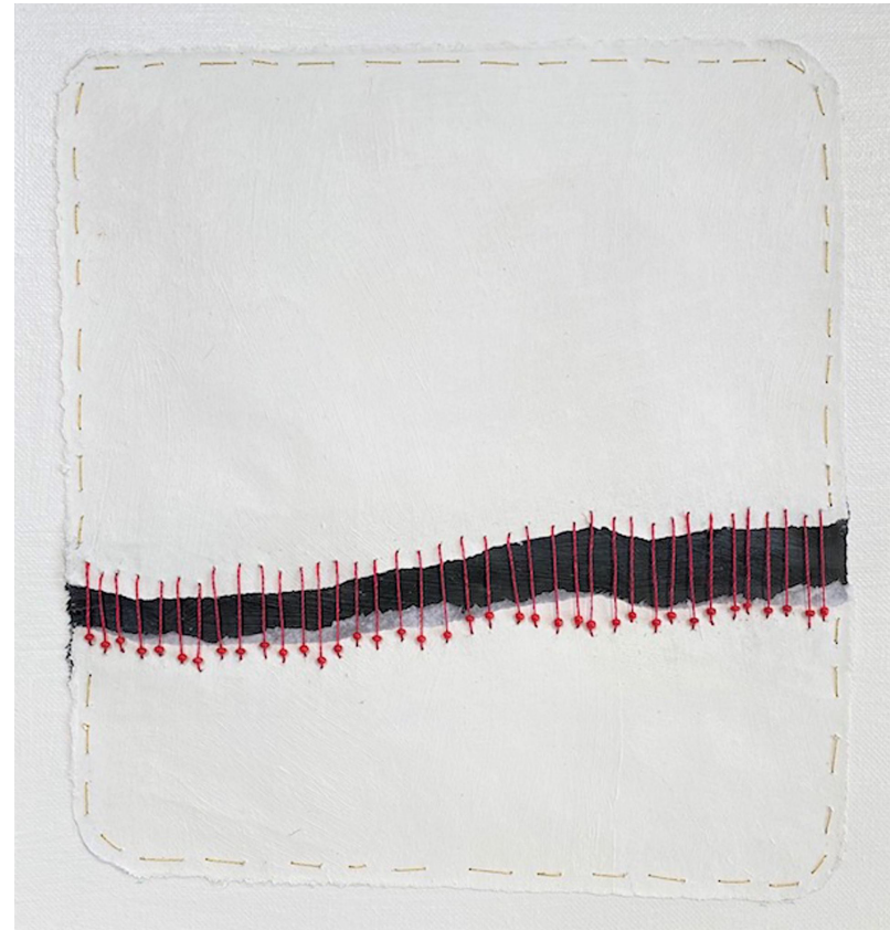
Phyllis Thomas Torn Acrylic with stitching