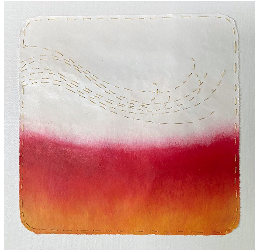
Phyllis Thomas On That Day Acrylic with stitching