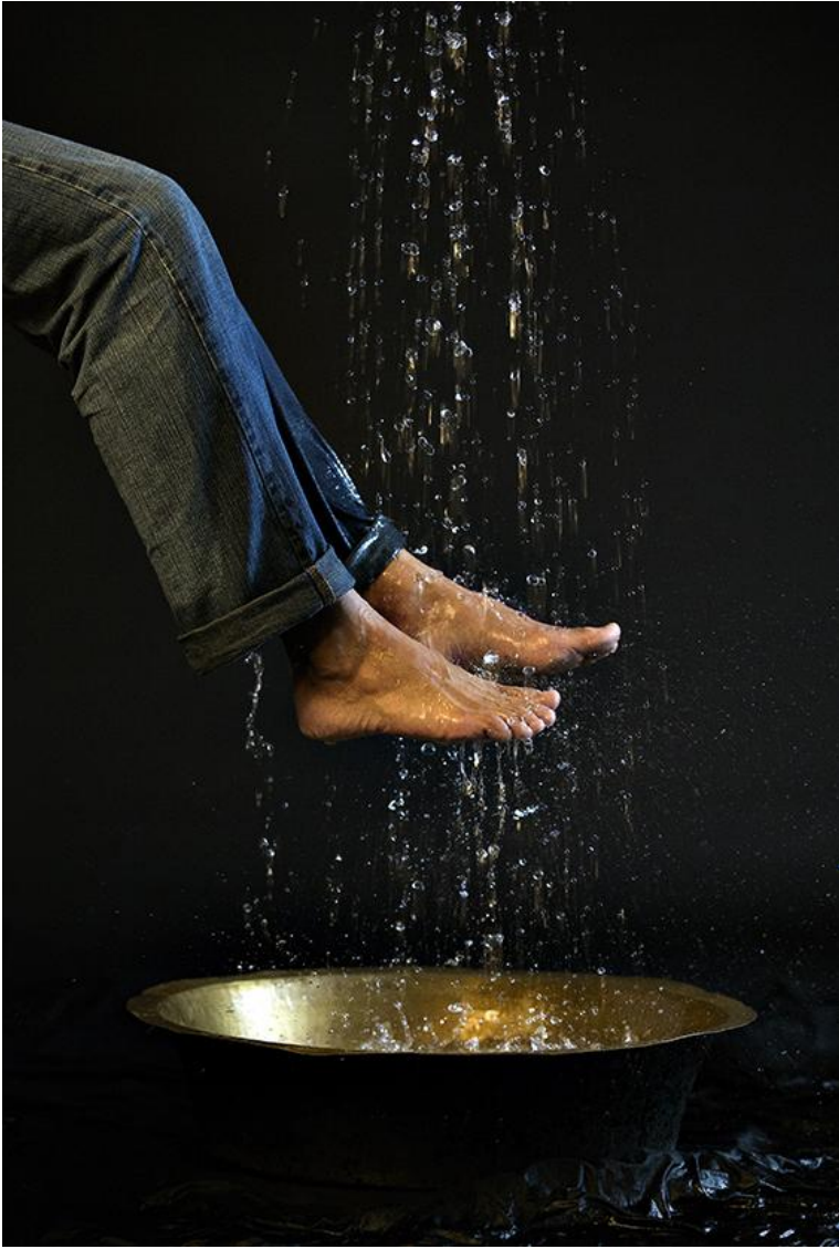
Didier Helson Foundation I Photograph