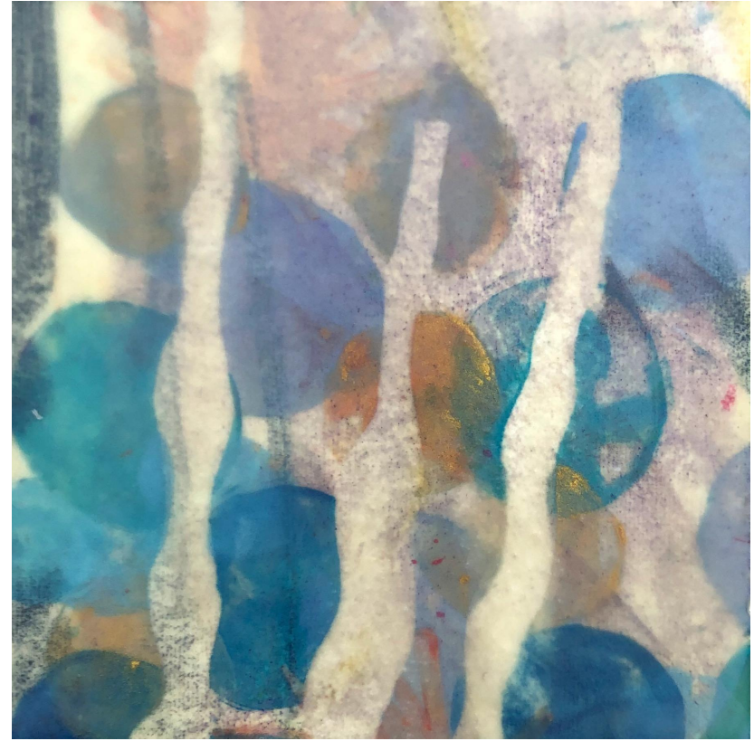
Kristie Kercheval Breaking Through Grief Encaustic Monoprint on Panel