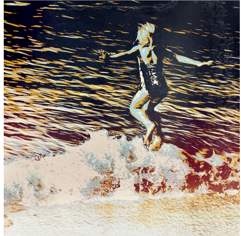
Bonnie Sanders Invitation Photography, graphic art, encaustics