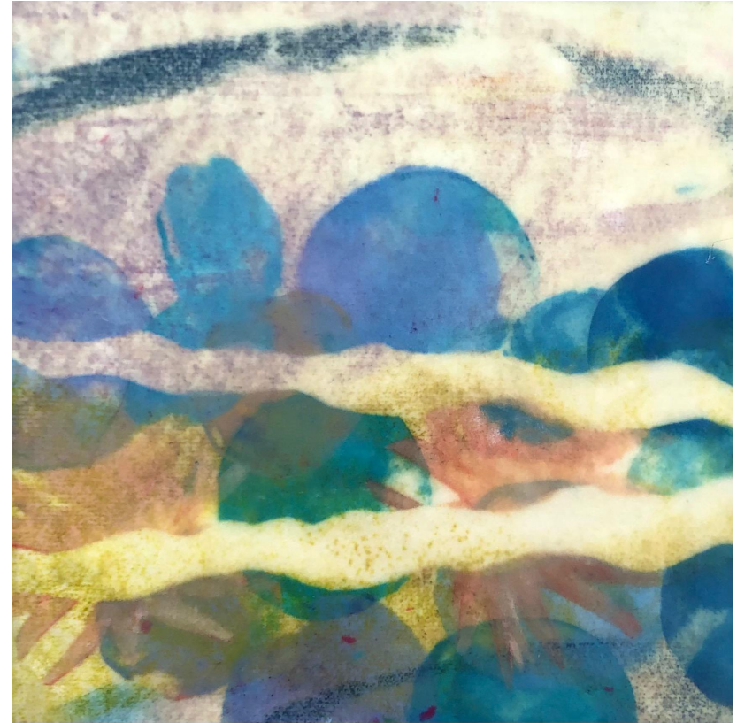
Kristie Kercheval Road Through Grief Encaustic monoprint on wood panel