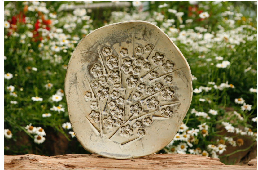
Dan Butkowski Wild Fields Ceramics