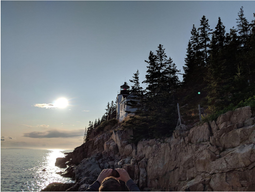
Jennifer Floth Acadia Lighthouse Photo canvas and felt mixed media