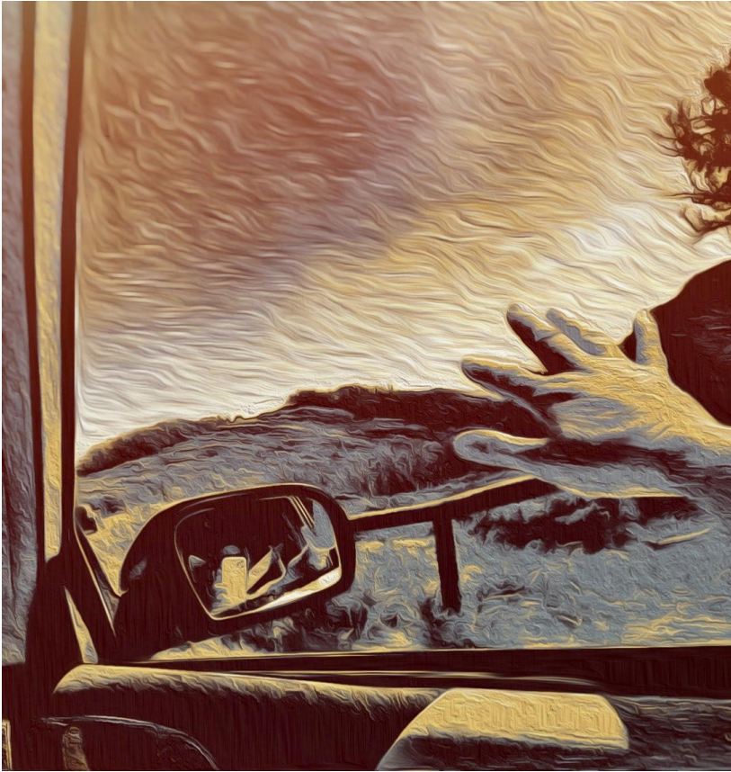
Bonnie Sanders Sunday Drive Photography, graphic art, encaustics