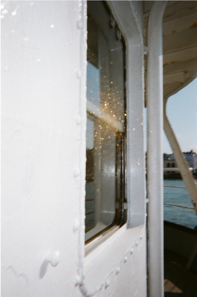
Dennissa Young Special Places: Istanbul 1 Performance documentation