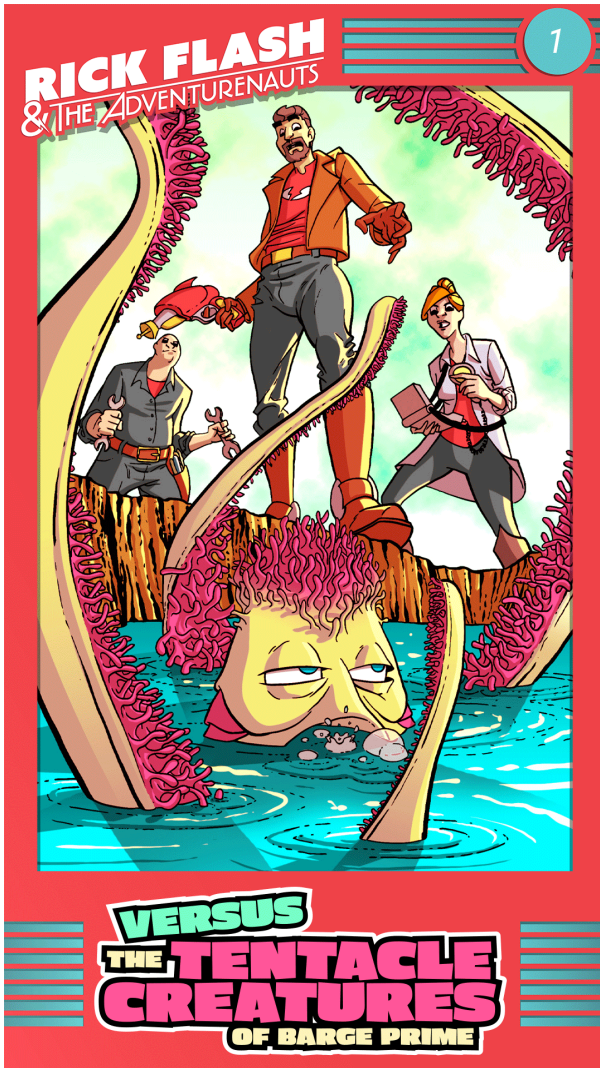
Mark Pate Rick Flash & The Adventureonauts Trading Card - Series 1 Card 1 NFT