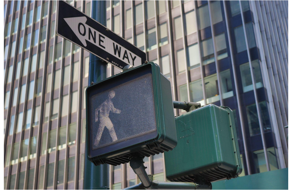
Jennifer Floth One Way Textiles on photo canvas