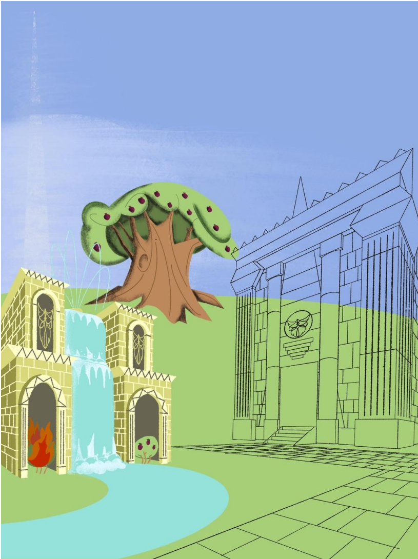
Chris Fox Work It & Keep It Digital illustration