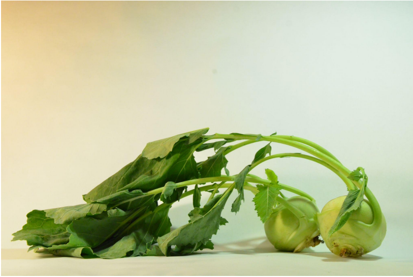
Brandi Voigt Fox Fidelity Printed fabric